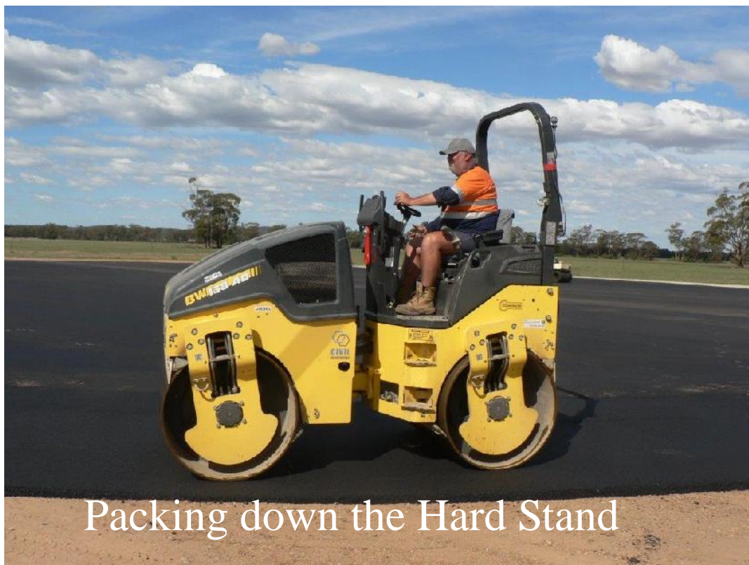
Packing down the Hard Stand