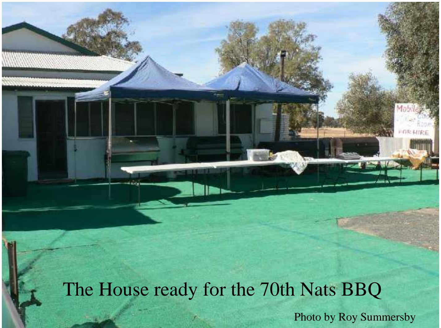
The House ready for the 70th Nats BBQ