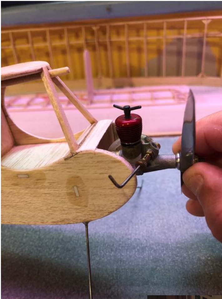
Gary Goodwin's Tiny Sniffer under Construction Bambi powered.