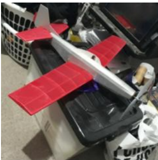
Here's another shot of it with something I like to call "Toilet Roll Thingy in a bag" in the background. The basket in the rear is my wife's attempt at art, she's a hack obviously. Before you ask, yes, we do amaze ourselves occasionally.