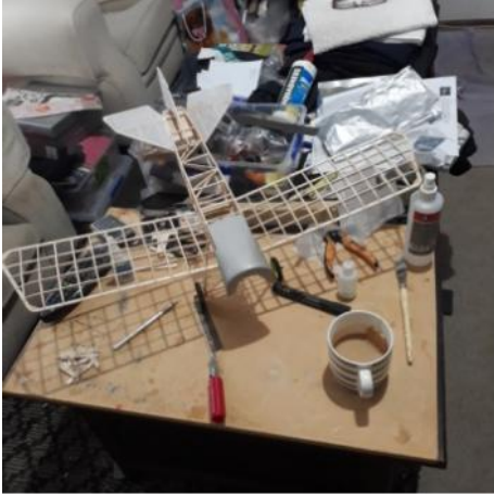
I made this cup of coffee. The mess around it was also my creation.