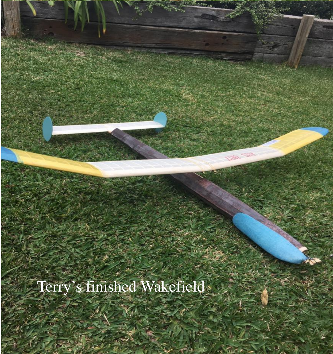
Terry's finished Wakefield