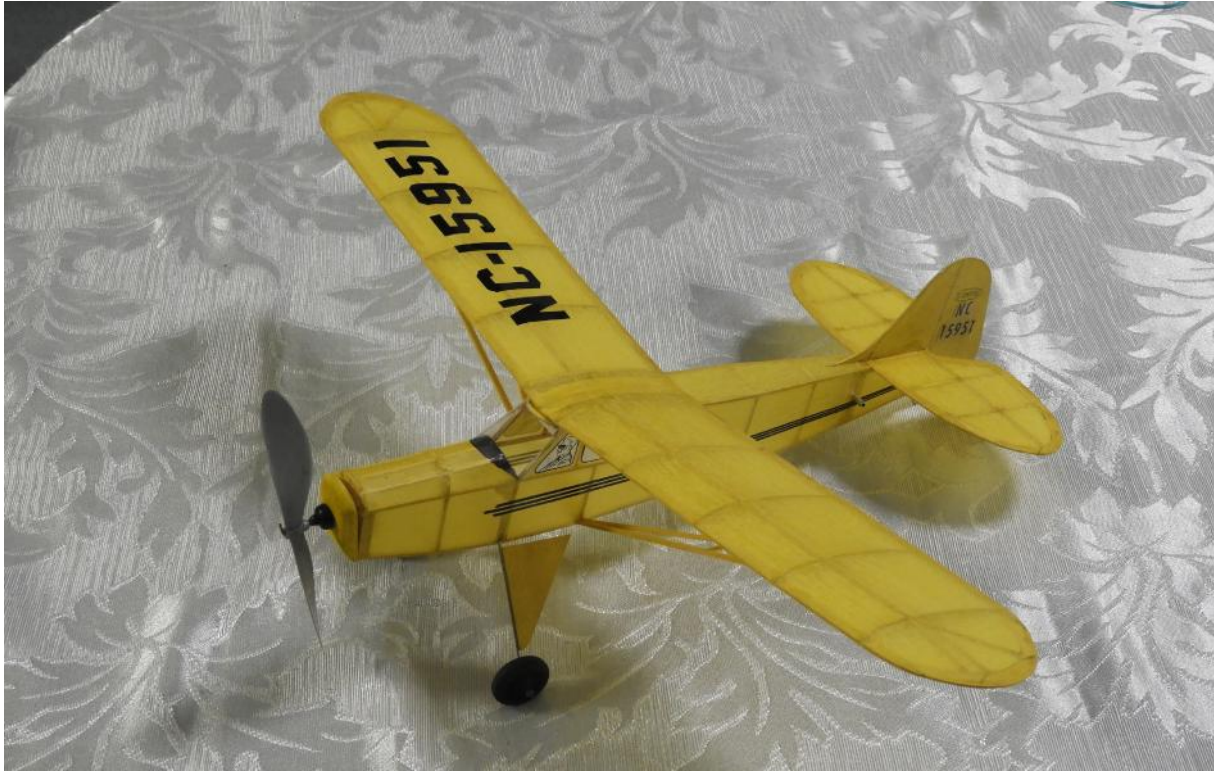
2 more of Phils models