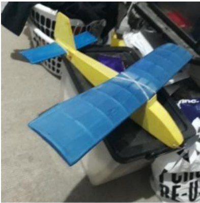
bag. I know, right?