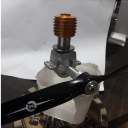
I modified this plastic tub by creatively cerating the top lip with a pair of pliers. Something of a pity it is partly obscured as it is truly exquisite.