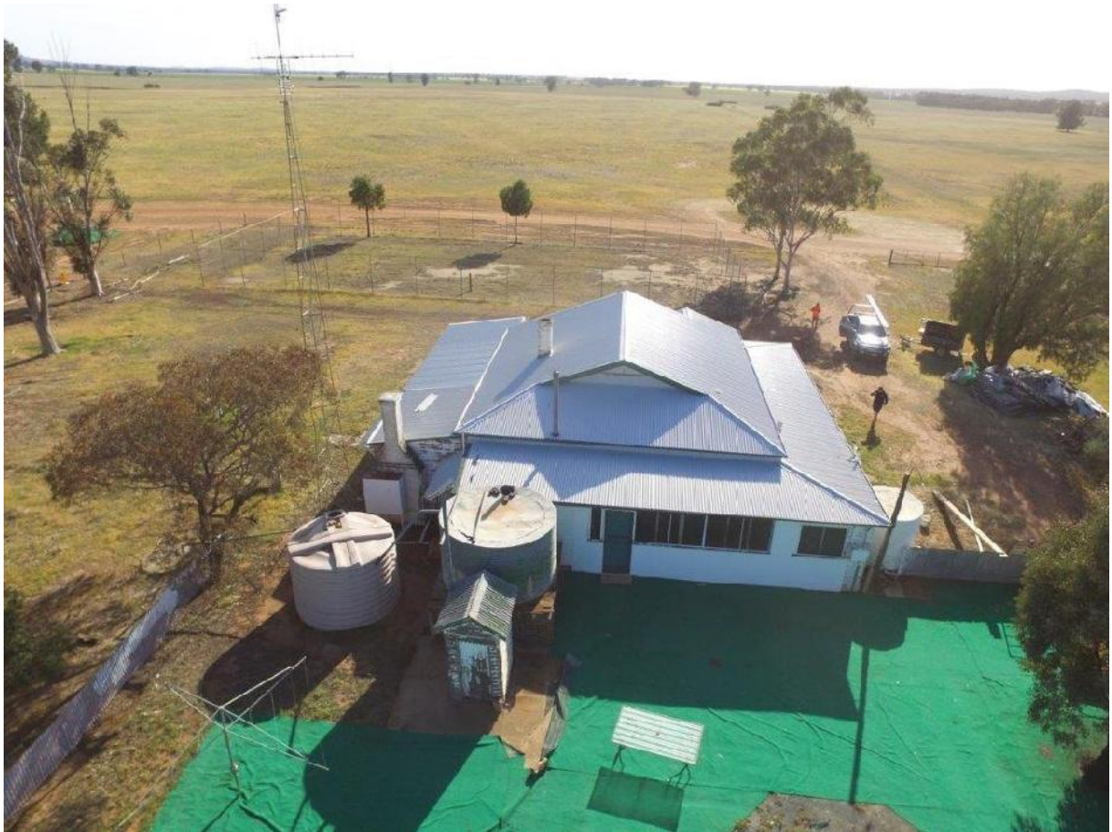
2 more views of house at West Wyalong