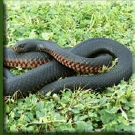
Red-bellied Black Snake