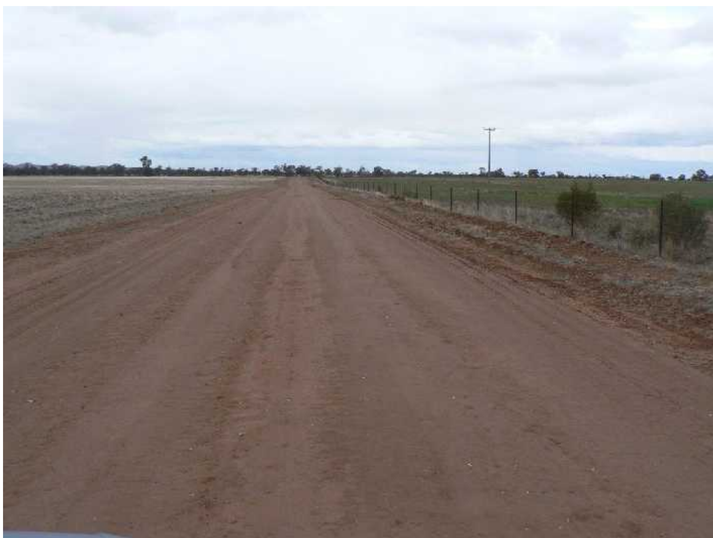
Road into AB Field at West Wyalong