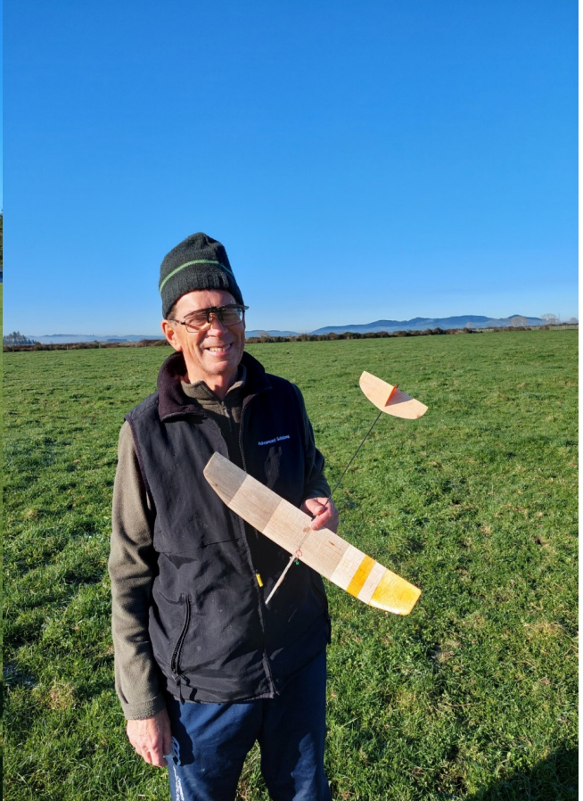
( flights early frosty mornings, NZ )