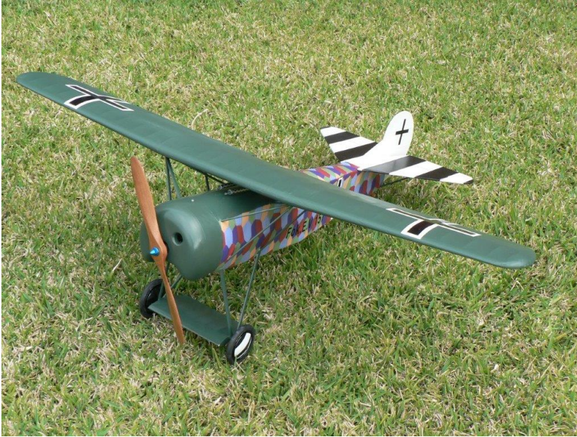
One of Roy's lock down Builds the Fokker D-8