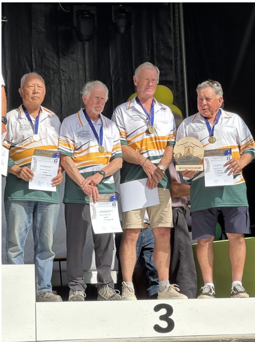
Our F1B Team managed 3 rd Place overall at the World Championships France 2023