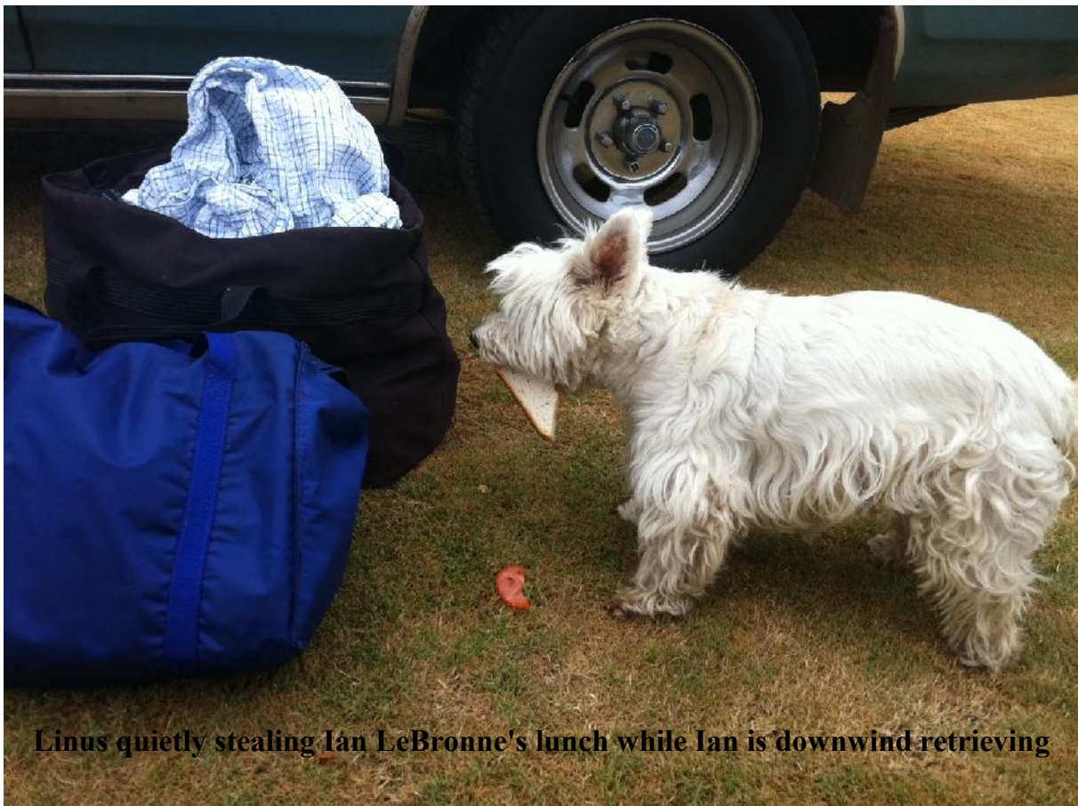
Linus quietly stealing Ian LeBronne's lunch while Ian is downwind retrieving