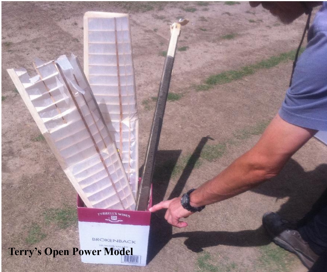
Terry's Open Power Model