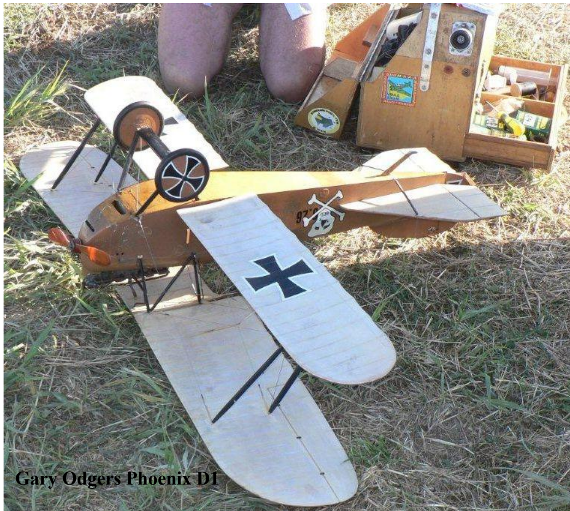
Gary Odgers Phoenix D1