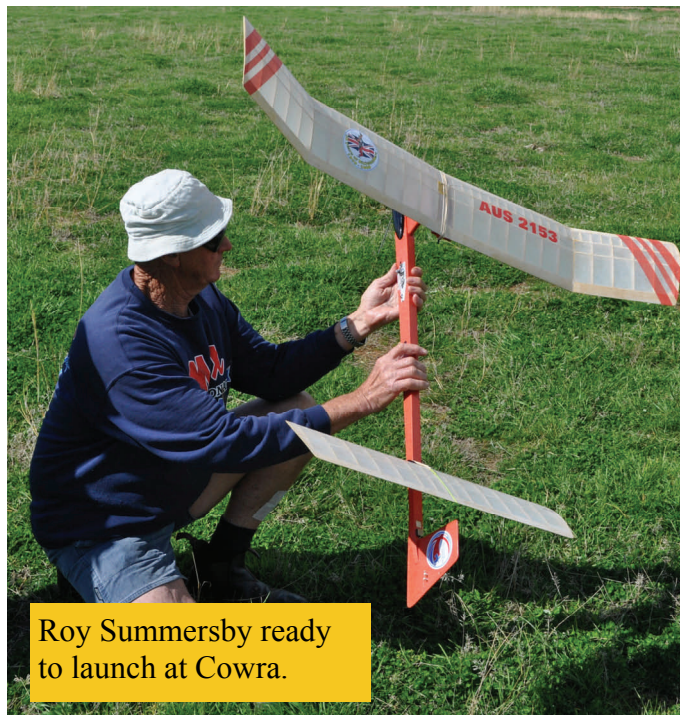
Roy Summersby ready to launch at Cowra.