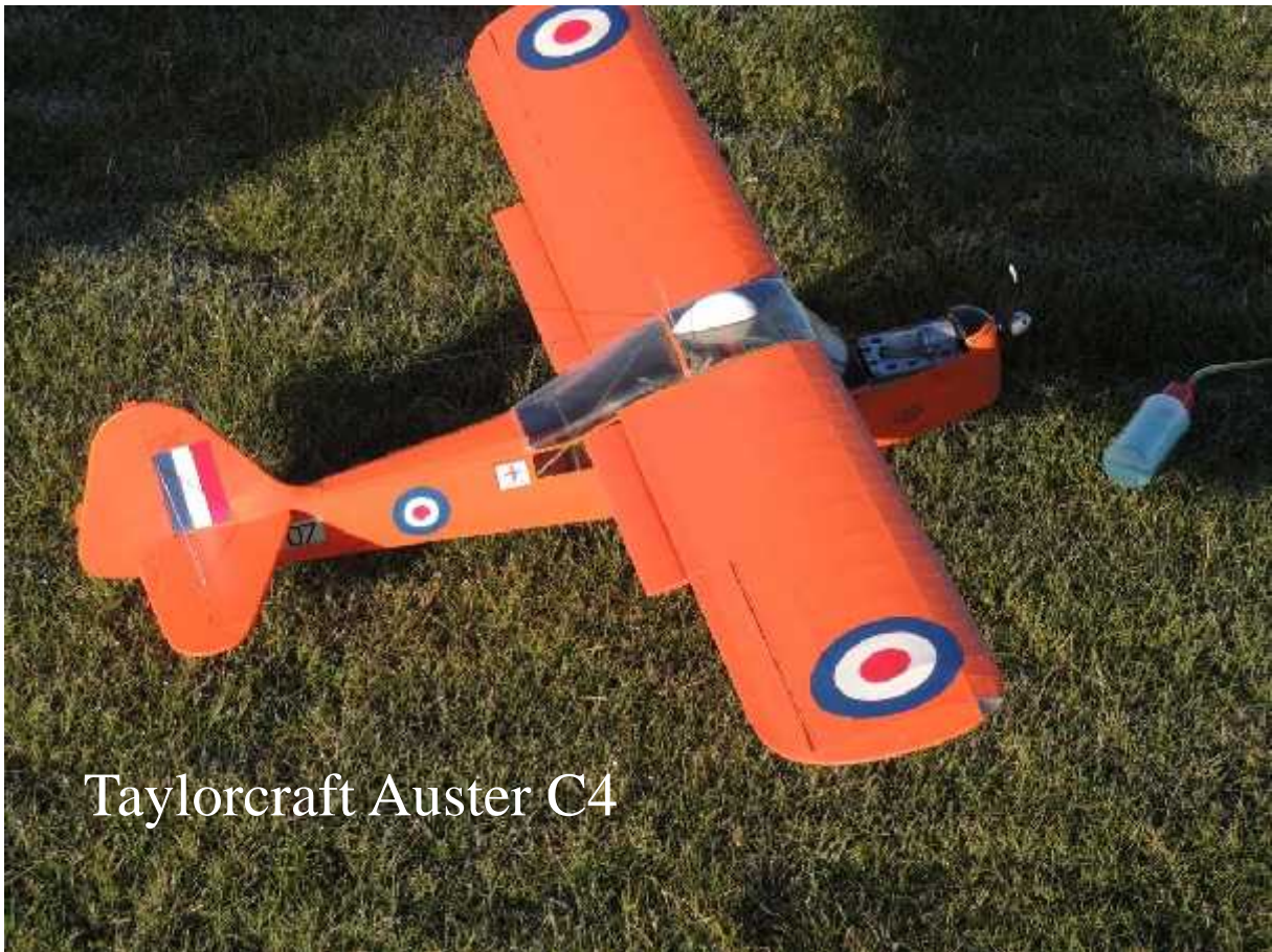
Taylorcraft Auster C4