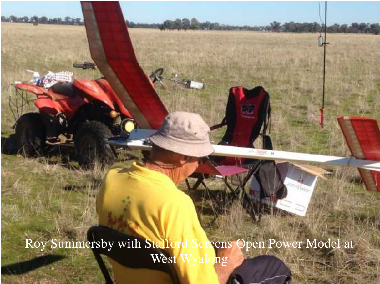
Roy Summersby with Stafford Screens Open Power Model at West Wyalong