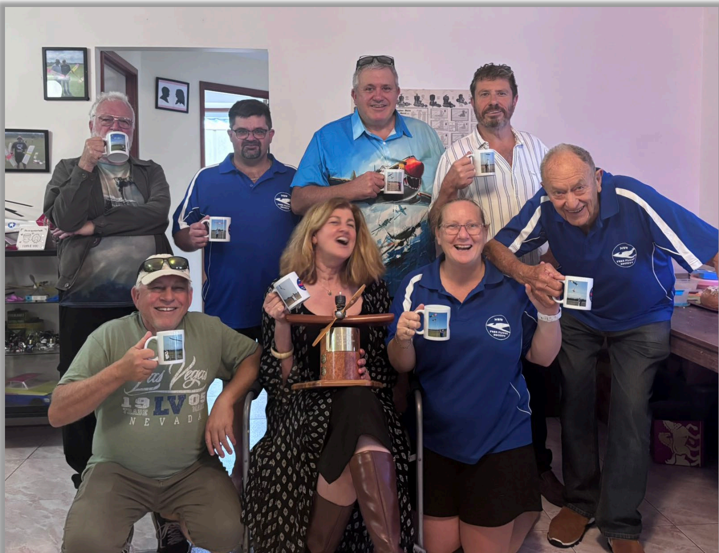
All our Winners at the 2025 Annual Presentation Dinner