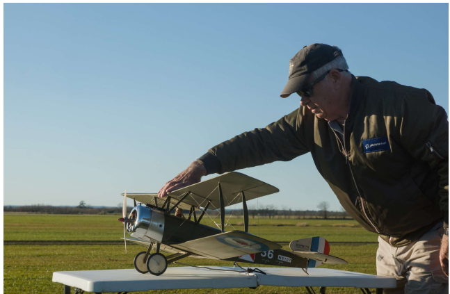
Pics left to right top to bottom: 1 Roys Fokker D8, 2 Phils Sopwith 1½ Strutter, 3 Phils Tiger Moth, 4 Phils Hawk Moth, 5 Roys SE5A, 6 Roys Stinson Voyager, 7 GanzAVIA Kft, 8 Phil Ws Gypsy Comper Swift, 9 Phil M with Sopwith 1½ Strutter