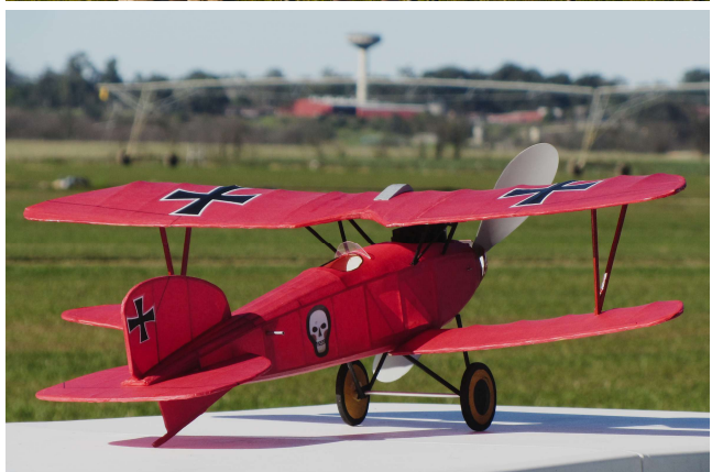
Pics left to right top to bottom: 1 Tahns DC3, 2 Natalie and her Piper J3, 3 Pauls Corben Super Ace, 4 Pauls Corben Super Ace, 5 Stans Auster T7c Antarctic, 6 Rickys Max Holste Broussard 7 Warrens P40 Warhawk 8 Phils Albatross DIII